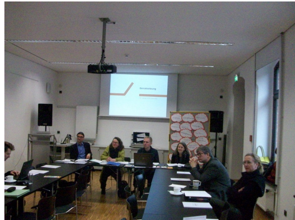
Figure 1: Future-workshop of the GSS at the Industriemuseum, Chemnitz

On February 17 - 18, 2018, a future-workshop "Quo vadis Semiotics?" and an advisory meeting of the German Society for Semiotics (GSS) took place at the Industriemuseum in Chemnitz. With about 25 participants it was a successful and constructive workshop with promising ideas for the future as well as an exchange about already started projects. This short article describes and comments on new proposals of the section for environment- and carto-/atlassemiotics (ECAS or UKAS/ Umwelt- und Karto-/Atlassemiotik) of the GSS.